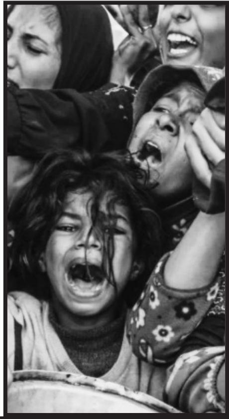
Below: South China Morning Page

of Deir Al Balah and Khan Younis later this week.