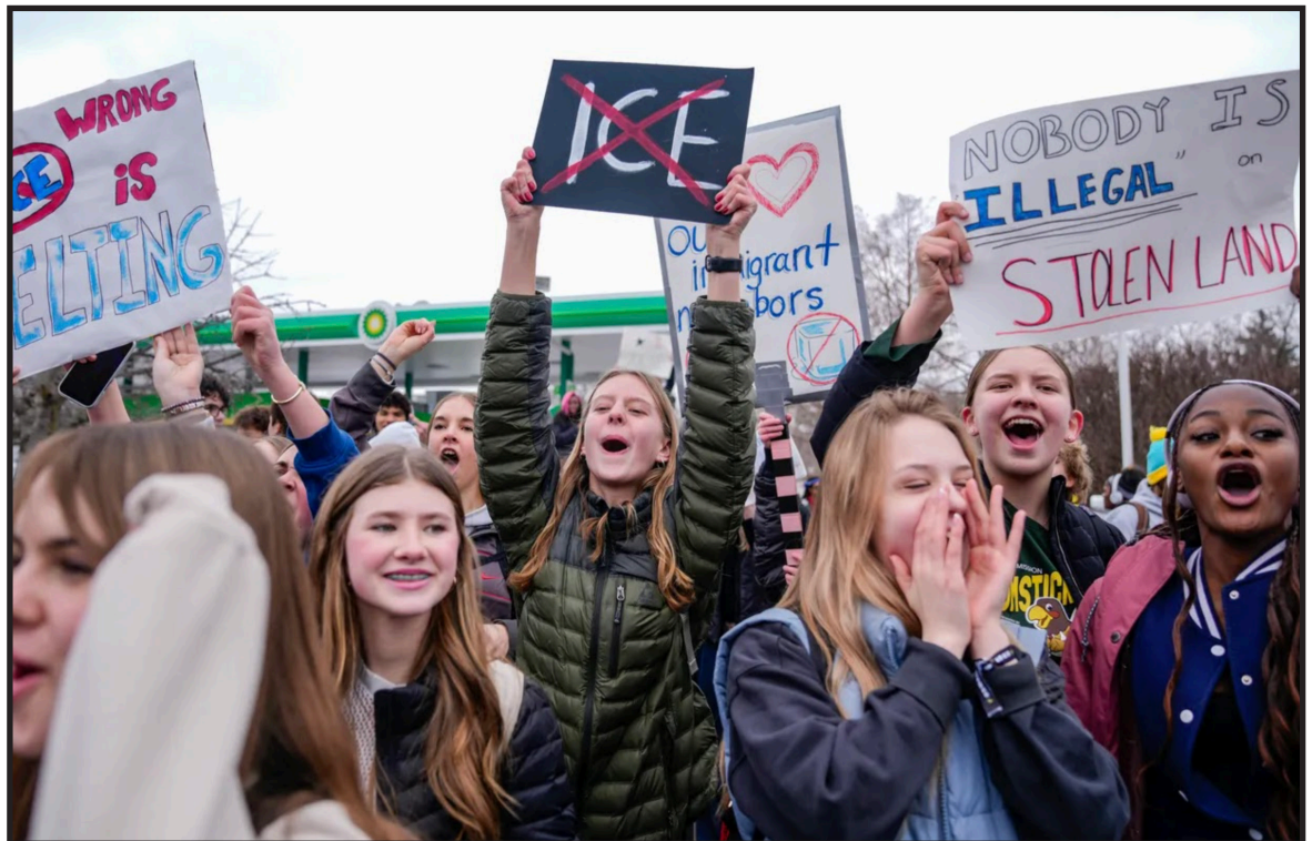
Above: Indy Times Below: Milwaukee School Journal

Teenagers and young adults are our future as so many adults have said and now they are making their voices heard. The question remains: will these protests continue? Will these teenagers continue making people hear them? And will they be able to do something like so many past protests have done?