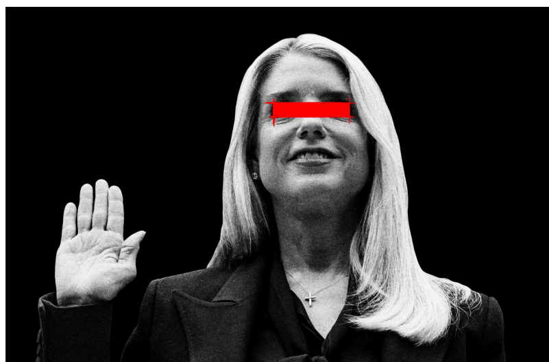
Illustration by Rebecca Chew/The New York Times

The law was clear. The Epstein Files Transparency Act, which passed nearly unanimously, required the United States Congress