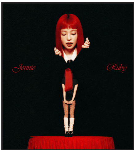
Photo: Jennie Album

ZEN by JENNIE: Golden hour, when everything and everyone shines! A song about true confidence and peace. Referencing many Buddhist traditions such as letting go of attachments and becoming pure. With lyrics like "Can't be two of one," Jennie speaks of how there have been many attempts of people trying to copy her, she's essentially saying be yourself and be happy with yourself so you don't find the need to copy anyone else. As she says it best, "nobody gon' touch my soul, gon' match my glow, like/ I dare you." Personally, this one might be my favorite.